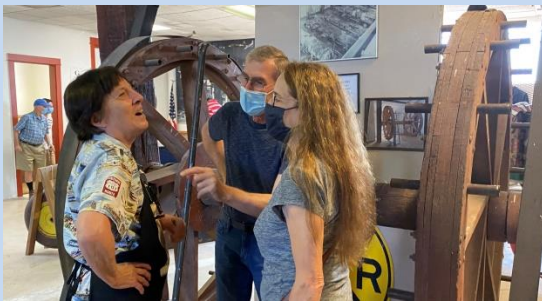
Corvette Club on tour of WHEELS