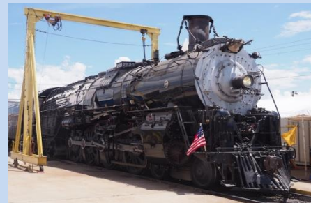
Santa Fe 2926

the beautiful dream machine, is now running after years of work. They will be collaborating with WHEELS to bring 2926 "home" to the railyards with access to the main line and the irreplaceable turntable that is located just east of the museum. The ultimate goal is to develop a true rail heritage park that will include tourist trips with the locomotive pulling historic passenger cars including WHEEL's Silver Iris 1952 sleeper/lounge car .