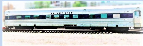
The Silver Iris